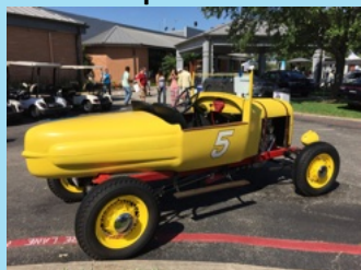
2016 Keels & Wheels photo

'Boat-Tail' is from two 1947 International pickup hoods, 4 cylinder Model A engine with Stromberg downdraft carburetor, & modern intake manifold, Kelsey 16" 'bent spoke' wheels, and rebuilt electrical system.