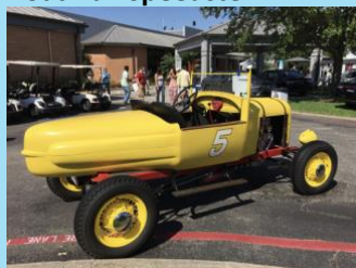
2016 Keels & Wheels photo

'Boat-Tail' is from two 1947 International pickup hoods, 4-cylinder Model A engine with Stromberg downdraft carburetor, & modern intake manifold, Kelsey 16" 'bent spoke' wheels, and rebuilt electrical system.